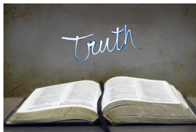
The Holy Bible (Original King James Version)

Sunday School Review: We Speak The Wisdom Of God In A Mystery: Scriptures: I Corinthians 2:7, 10-11